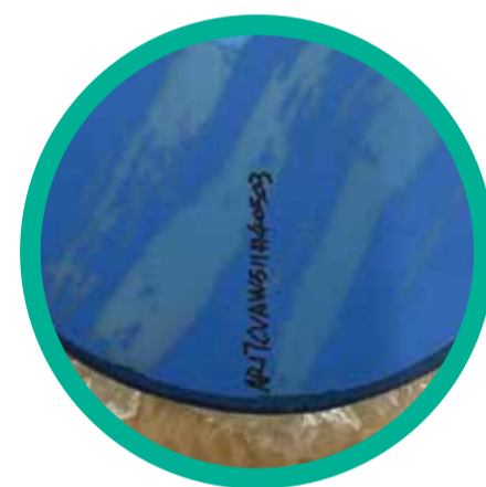
DIRECTIONAL Located on the tail of the bottom deck, along the stringer.