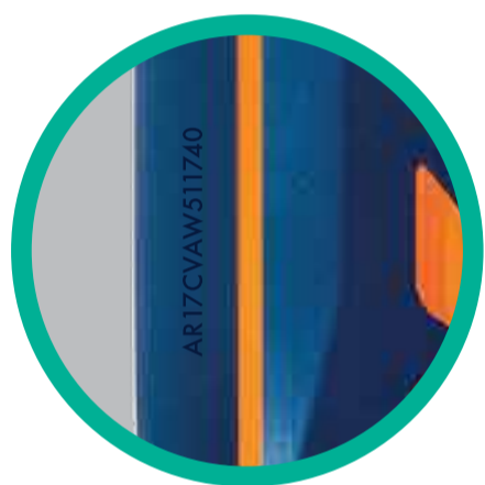
TWINTIP Located on the rail edge of the top deck.