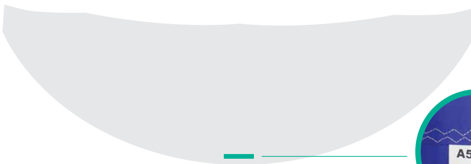
KITE Located on the leading edge under the canopy, along the seam. Three seams away from the centre.